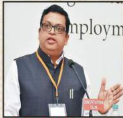
Shri Gopal Krishna Agarwal Hon'ble National Spokesperson of Bhartiya Janta Party (Economic Affairs)